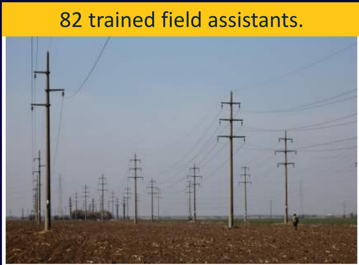
82 trained field assistants.

A field survey was carried out (01/2021 - 10/2022), covered almost 1,580 km of 8 types of the above ground power lines (10 kV, 20 kV, 22 kV, 35 kV, 110 kV, 220 kV, 400 kV, and electric railway lines) and 12,535 poles in 25 SPAs and their adjacent areas located in Austria, Slovakia, Hungary, Croatia, Bulgaria, Romania, and in 9 IBAs in Serbia.