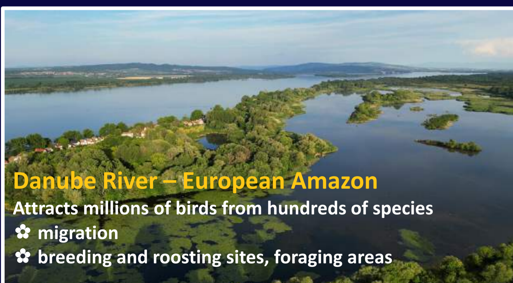
Danube River – European Amazon Attracts millions of birds from hundreds of species ✿ migration ✿ breeding and roosting sites, foraging areas