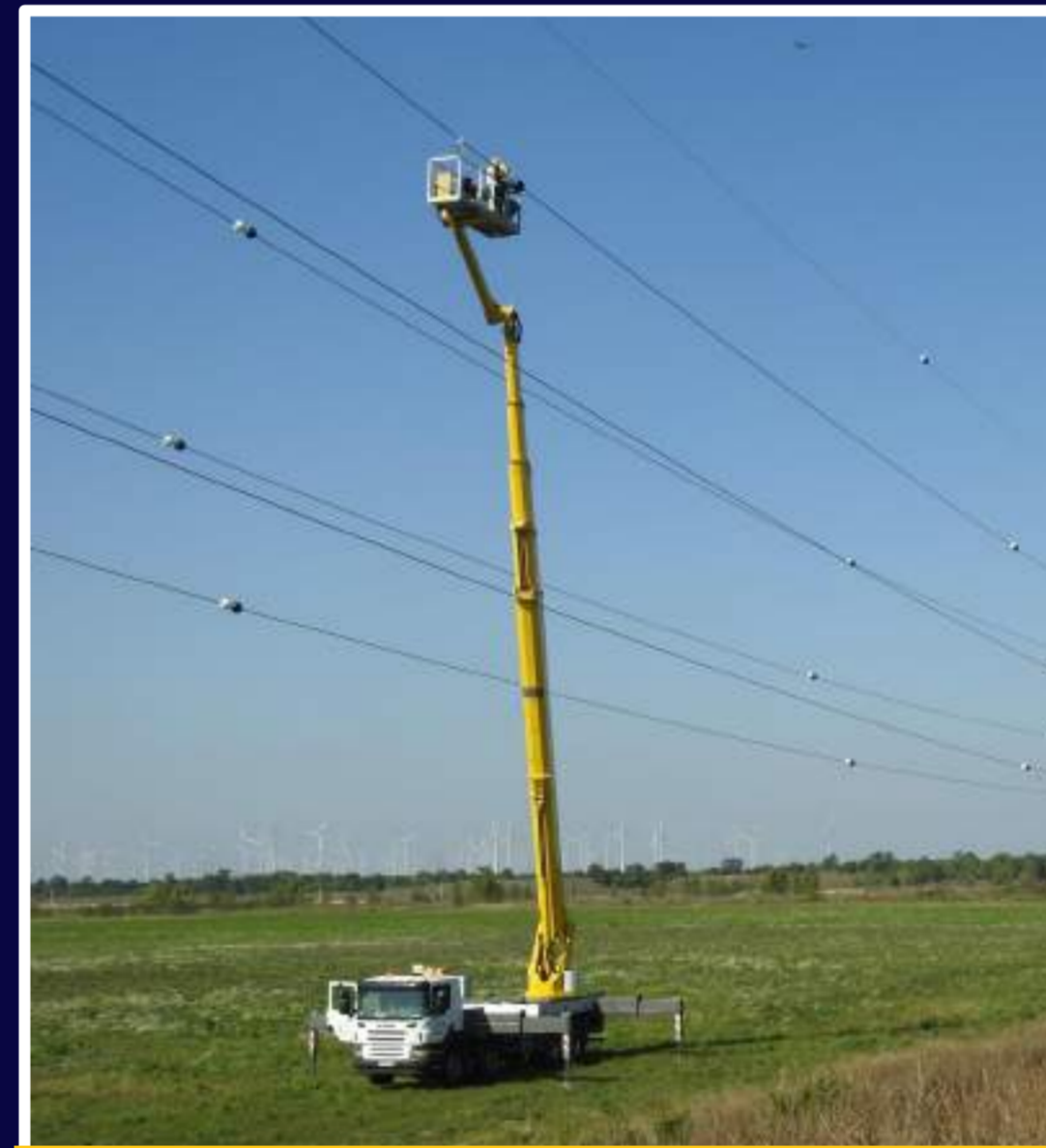
Different methods of installation of bird flight diverters were applied.