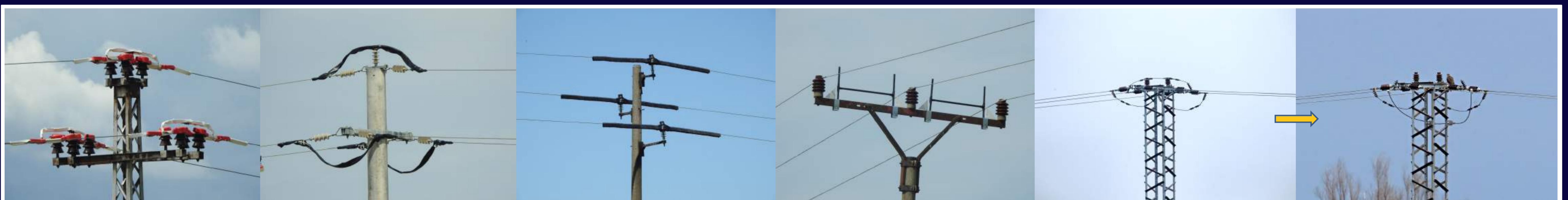
More than 4,000 utility poles insulated or modified to avoid electrocution. The elements must be installed properly to ensure safety for birds.