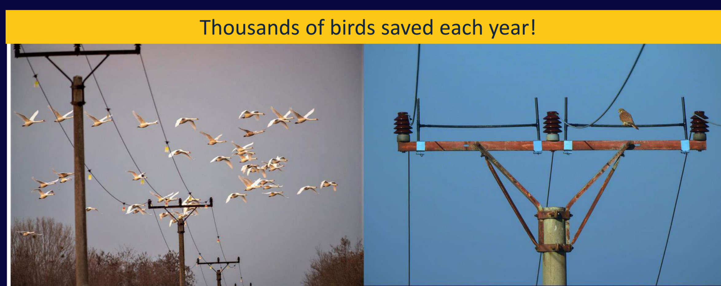
Thousands of birds saved each year!