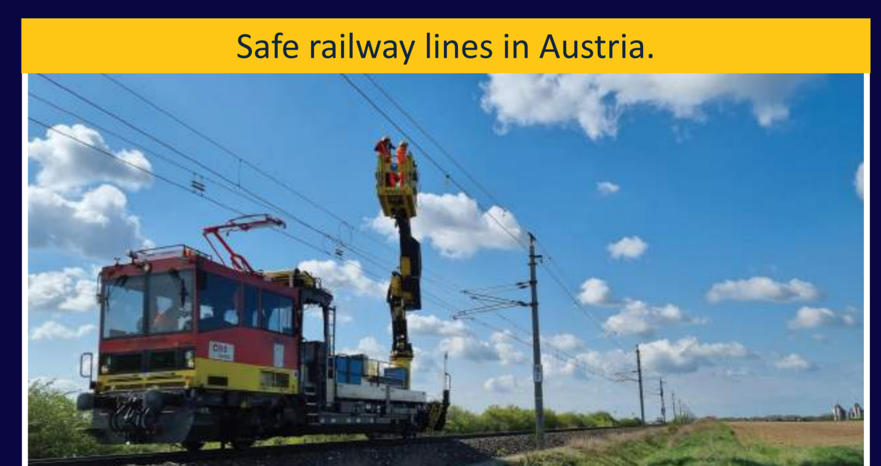
Safe railway lines in Austria.