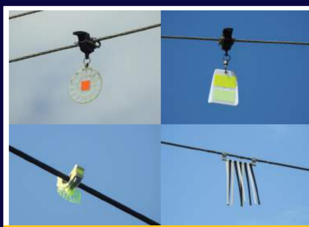
Several types of bird flight diverters were used, new types were developed and tested.